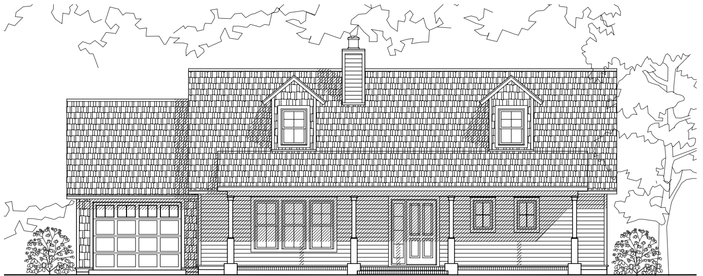
1. FRONT ELEVATION D-1 SCALE: NTS