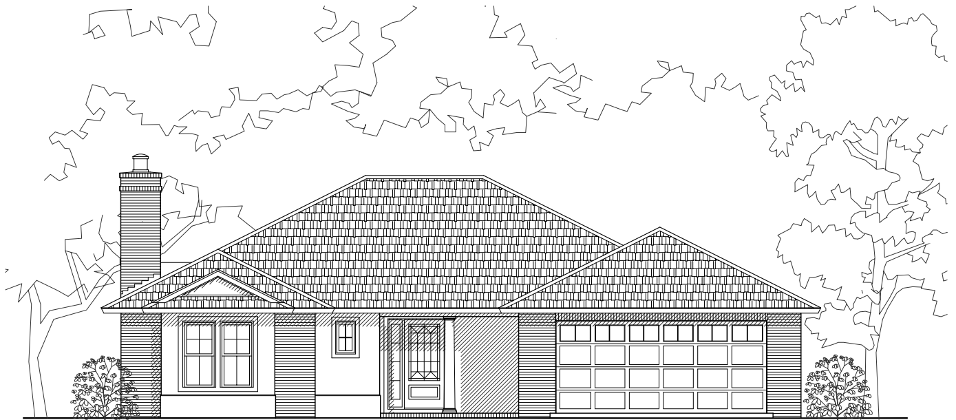
2. FRONT ELEVATION C-1 SCALE: NTS